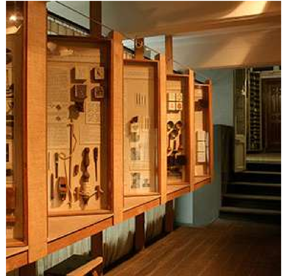
The Calico Museum