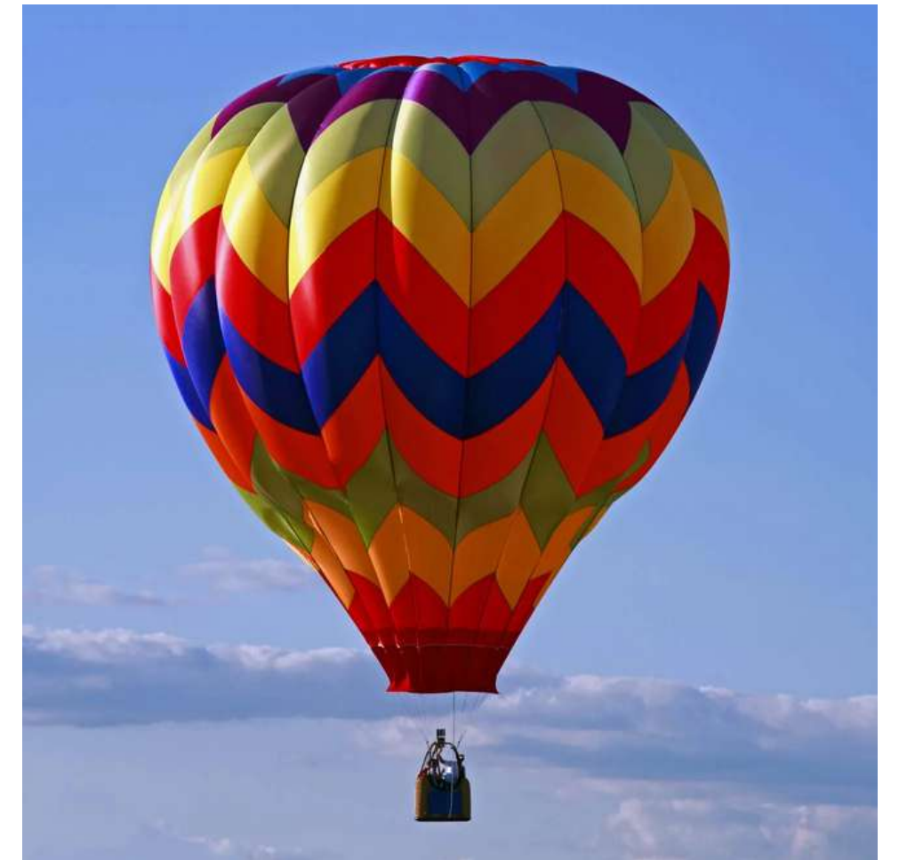
Hot Air Balloon Ride