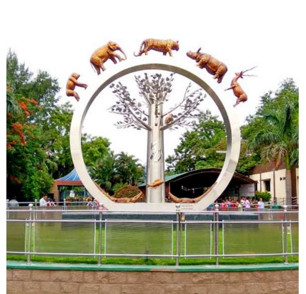
Nehru Zoological Park