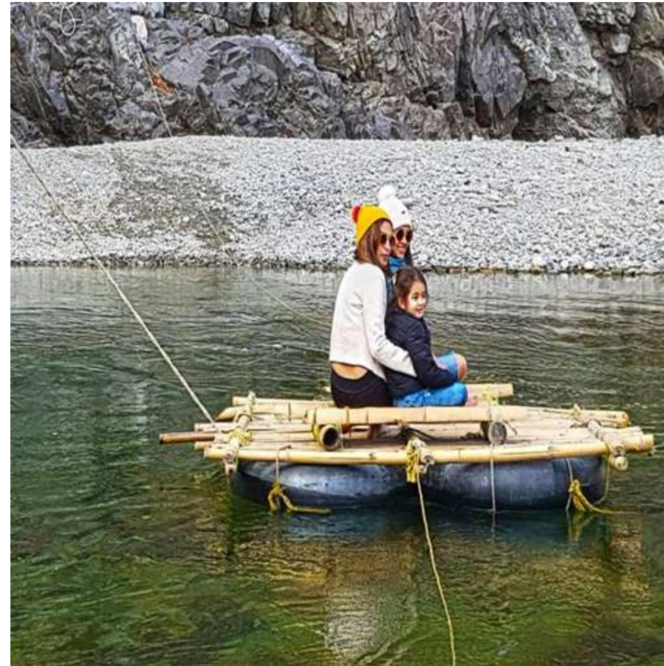
Boating on Kosi River