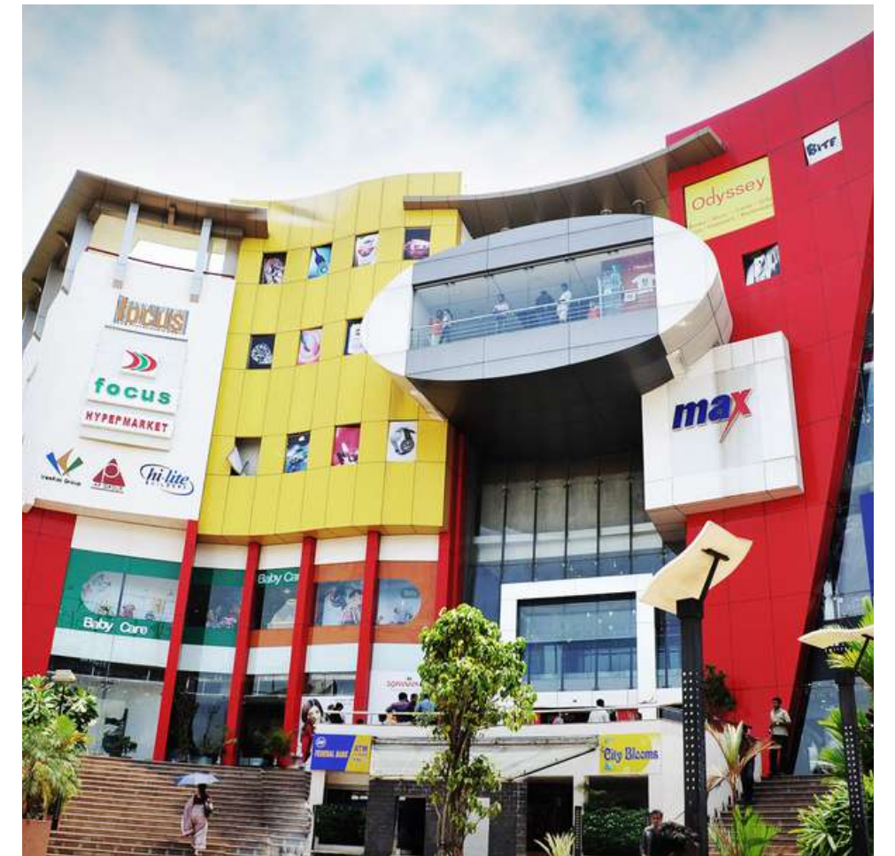
The Focus Mall