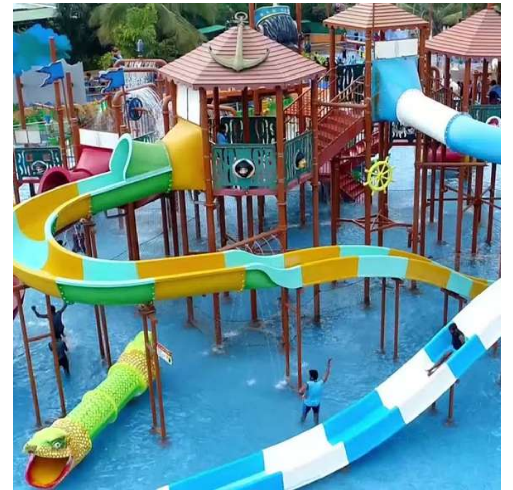
Wet n Joy Water Park