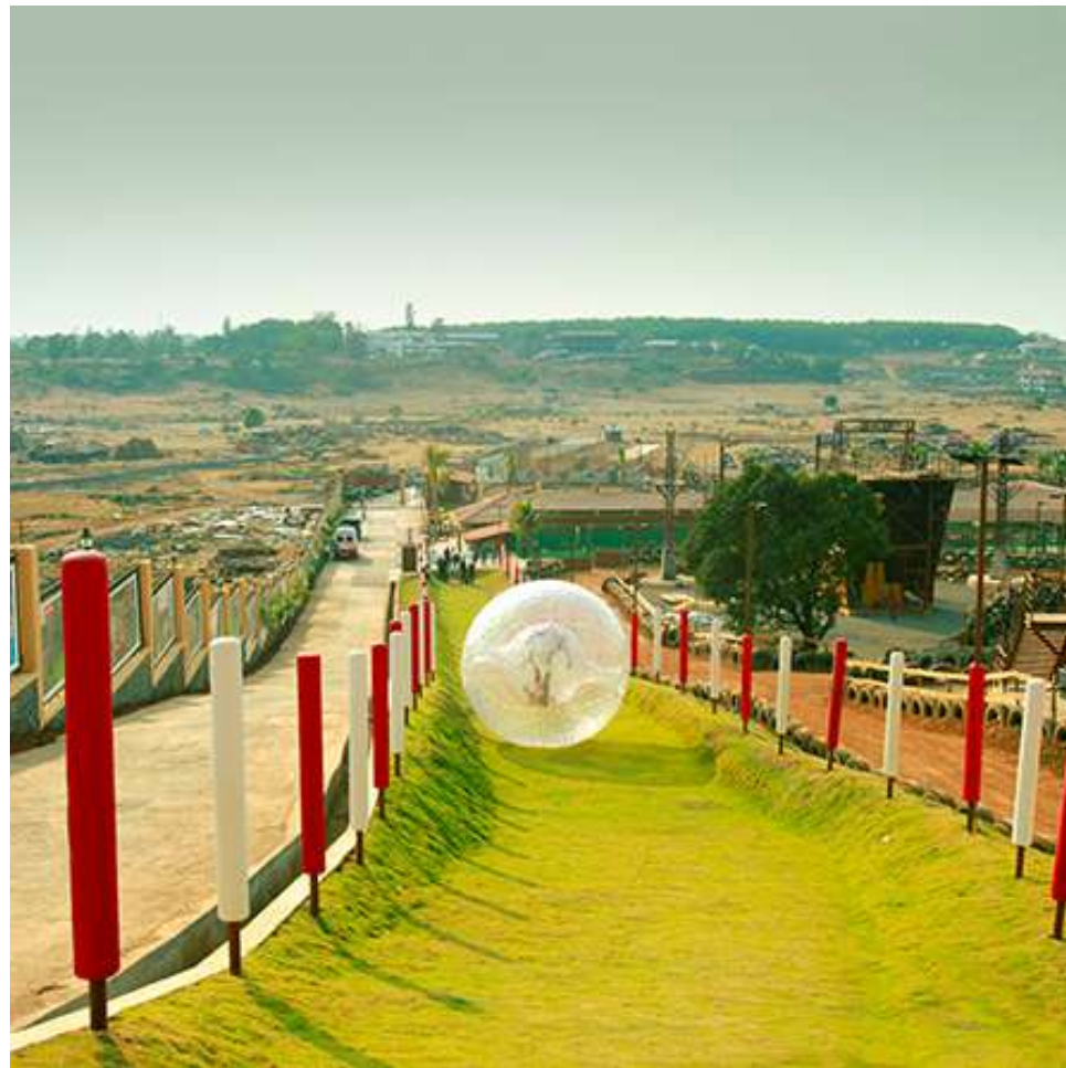
Della Adventure Park

One of the best weekend getaways near Mumbai and Pune is Lonavala, which offers a variety of fun activities for both individuals and groups.